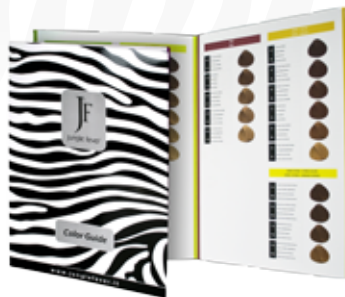
Photographic Color Guide Cod. 9142