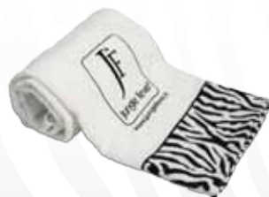
Towel Cod. 9232