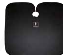
Coloring Cape Cod. 9230