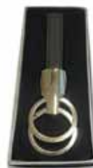
Key Ring Cod. 9147