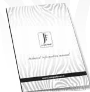
Technical Information Manual Cod. 9156B