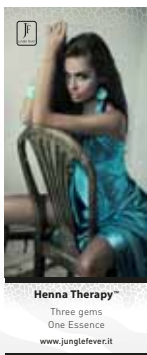
Roll-up Banner 85x208 cm Cod. 9104