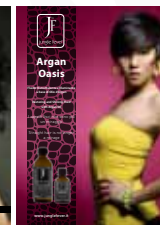
Poster 48x138 cm - 70x100 cm Cod. 9102