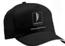
Cap Cod. 9150