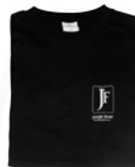
T-shirt Women's Size M-L Cod. 9151-2 Men's Size M-L Cod. 9153-4