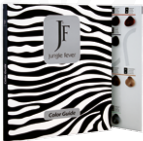
Color Guide Cod. 9103