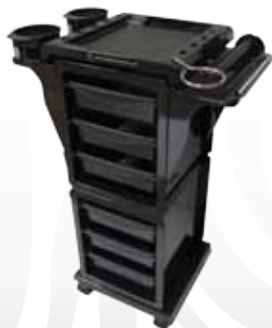
Colorist Trolley Cod. 9146