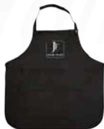
Apron Cod. 9141