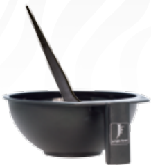
Tint Bowl & Brush Cod. 9106-7