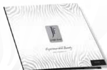
Catalogue Cod. 9155B