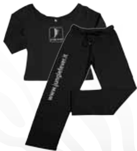
Women's Sweatsuit Size S-M-L-XL Cod. 9233-4-5-6