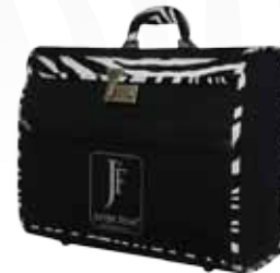
Bag Cod. 9150