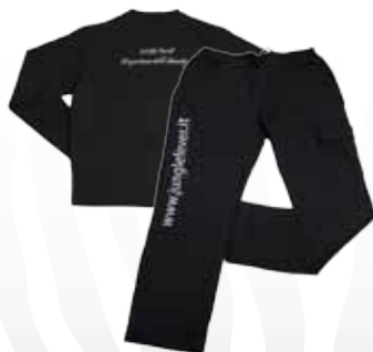
Men's Sweatsuit Size M-L-XL Cod. 9237-8-9