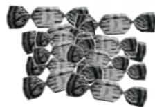
Candy Cod. 9140