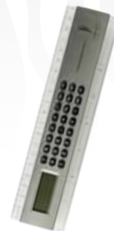
Ruler with Calculator Cod. 9148