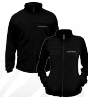
Jacket Women's Size S-M-L Cod. 9240-1-2 Men's Size S-M-L Cod. 9243-4-5