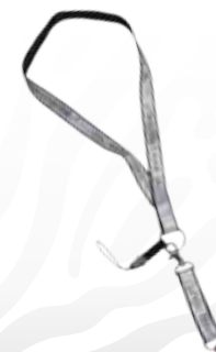
Badge Holder Cod. 9099