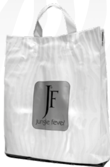
Shopper Cod. 9143