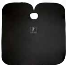
Cutting Cape Cod. 9231